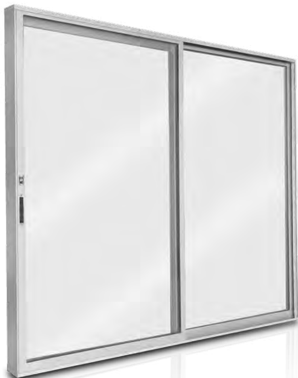
ULT5000 [XO] shown with Futura Flush Handle and Futura Flush Thumbturn. Clear Anodize Finish. Hardware options see page 30.