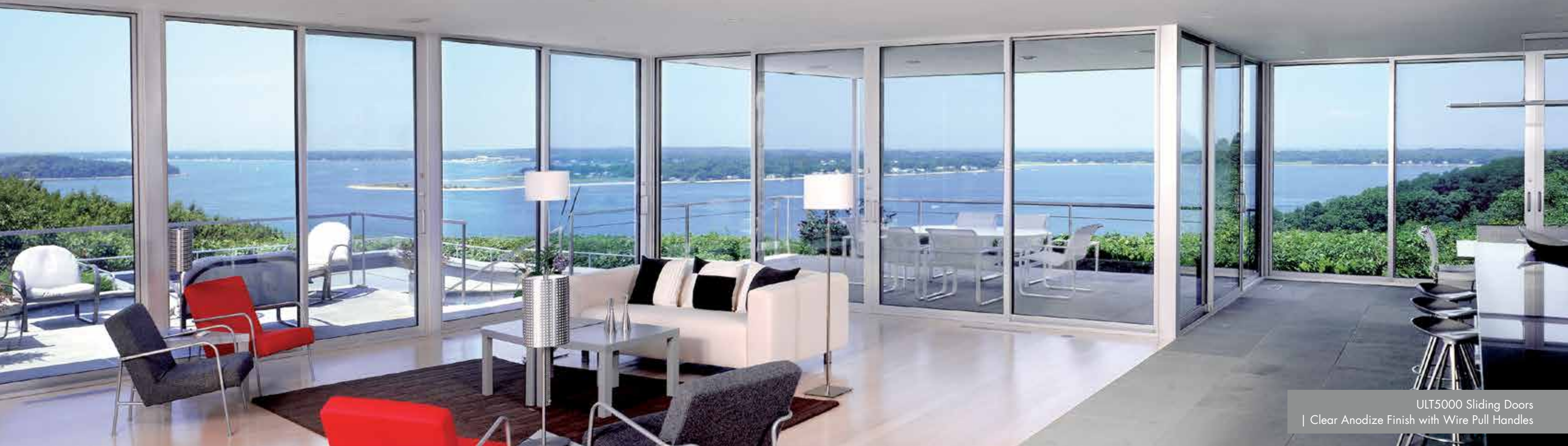
ULT5000 Sliding Doors | Clear Anodize Finish with Wire Pull Handles