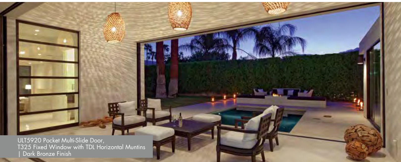
ULT5920 Pocket Multi-Slide Door, T325 Fixed Window with TDL Horizontal Muntins | Dark Bronze Finish

Sliding Doors, also referred to as Arcadia Doors, have earned a reputation as the most versatile and practical door type for access to decks and patios. They also score highly for delivering expansive views while remaining cost effective.